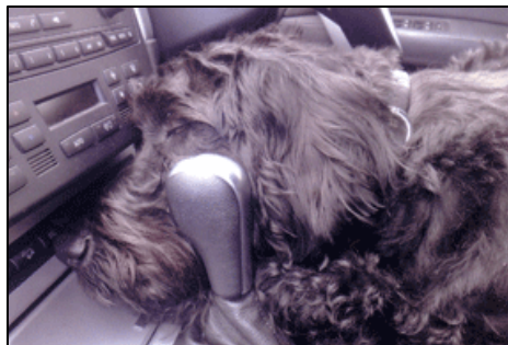
All that driving wears me out!!