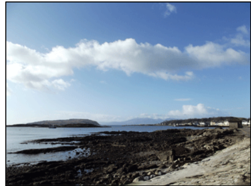
BEAUTIFUL ISLE OF CUMBRAE

YOU'VE BOOKED YOUR HOLIDAY IN ADVANCE SO NOW DON'T FORGET TO BOOK IN THE DOG.